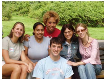
The Astoria Community came together for the GSV Orientation in August

Our challenge, we have found, has been to find our spirituality in even the most stressful of moments, to find the face of God in even the most difficult children with whom we work. We are discovering that our relationship with God cannot be restricted to our churches or to the thanksgiving we offer before meals. We are learning that our spirituality does not stand alone. Rather, it is in communion with the equality we are working toward, with a thirst for justice, with a desire to know the Creator we knew during our seven days together in Nyack. Our spirituality has become a path, and we are striving to view our challenges in our work not as stumbling blocks, but as that which will strengthen our journey.